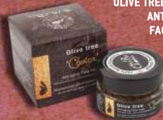
OLIVE TREE CAVIAR ANTI-AGING FACE MASK