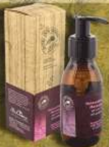
RELAXING MASSAGE OIL with gardenia