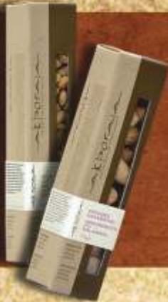
GROUNDNUTS & PISTACCHIO NUTS