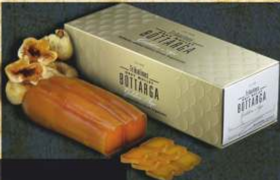
GOLDEN AGE BOTTARGA