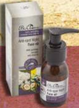
ANTI-SPOT NIGHT FACE OIL