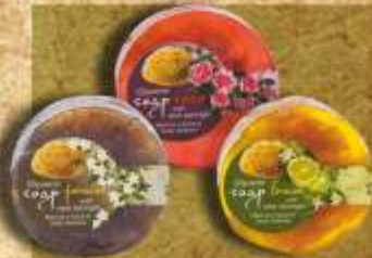
SOAP WITH SEA SPONGE