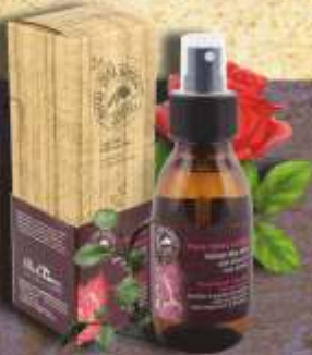
FACE TONIC LOTION with dittany & rose extract