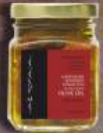
HANDMADE SUNDRIED TOMATOES IN OLIVE OIL