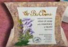
OLIVE OIL SOAP WITH ROSEMARY & LAUREL