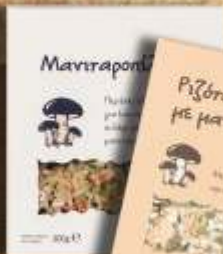
RISOTO WITH MUSHROOMS